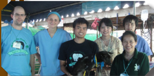
Veterinary Team